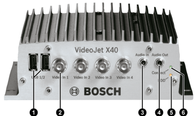
VideoJet X40 - front